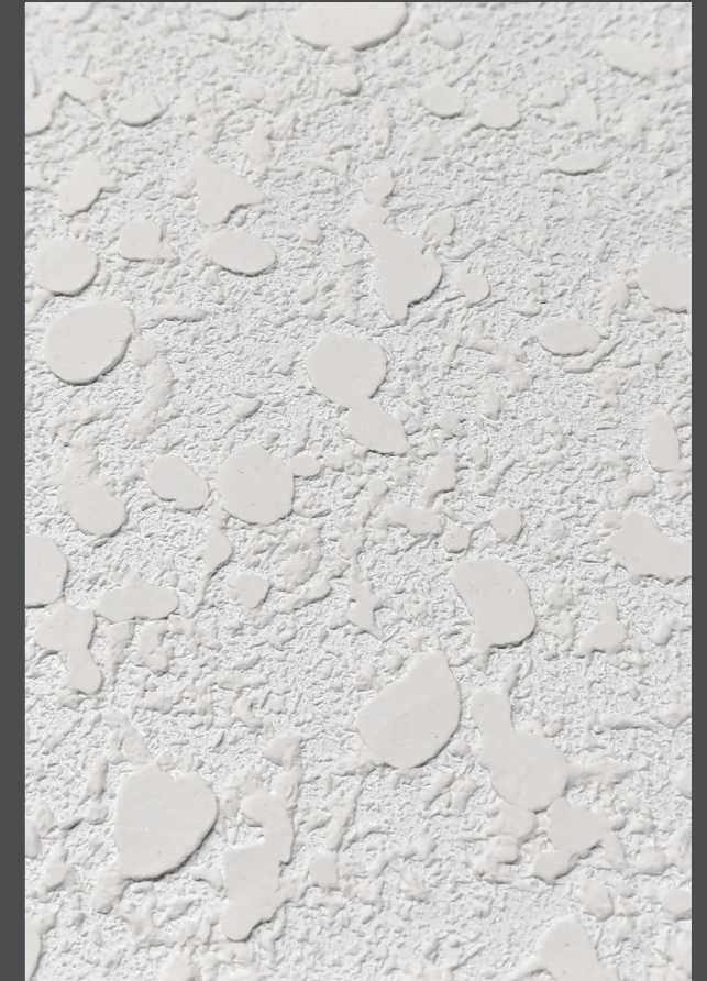
JUMBO-HEAD CUT (L)