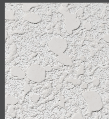
JUMBO-HEAD CUT (L)