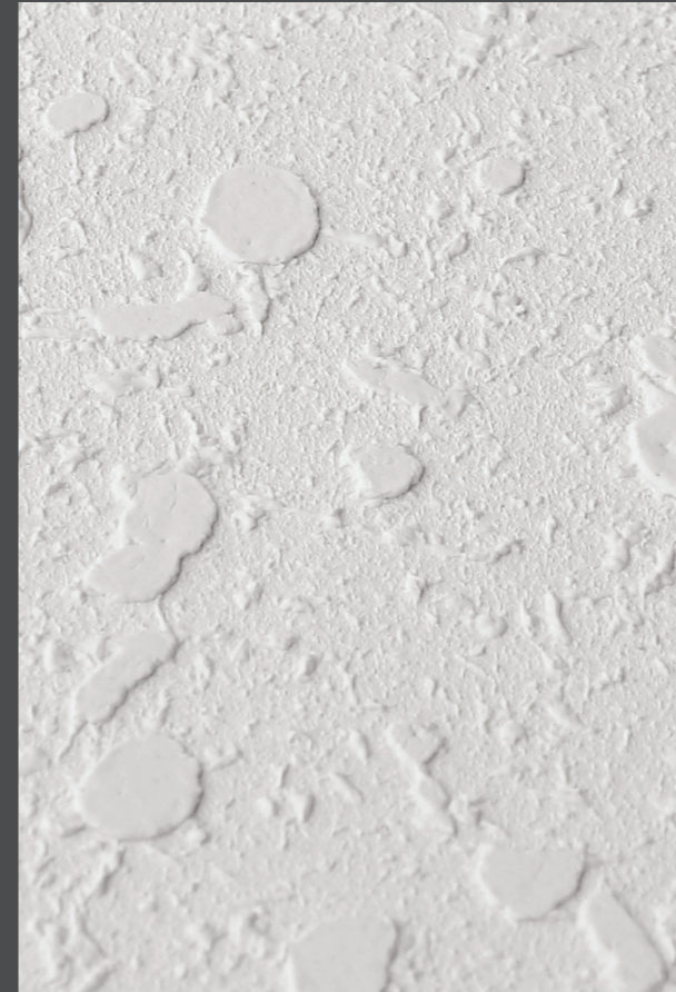
JUMBO-HEAD CUT WITH PU COATING (L)