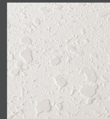
JUMBO-HEAD CUT (M)